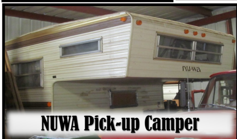
NUWA Pick-up Camper

1983 Chevy Car 82,000 Actual Miles 4 Door Stored Inside