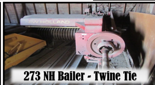
273 NH Bailer - Twine Tie