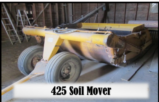
425 Soil Mover

Rock & Rock Posts Wheel Barrows & Yard Tools Fire Rim & Wood Chipper Rolls of Yard Fencing Garden Seeder & Garden Supplies Bird Houses Picnic Table Lawn Sprayer & Lawn Sweeper Ladder Window Bridge