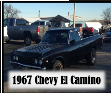
1967 Chevy El Camino